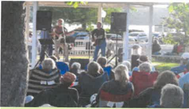
Monday Night Concerts at the Gazebo in Harborside Park