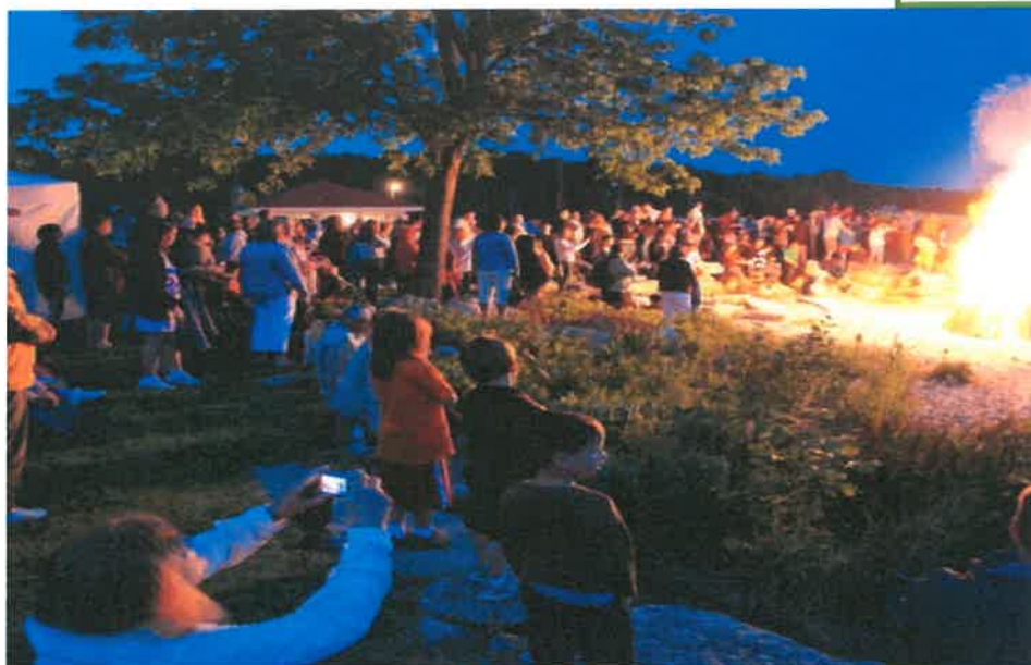
FYR BAL Chasing the Winter Witch

Climate: The climate in Ephraim is temperate, with warm summers and cold winters. Guess we all knew that!