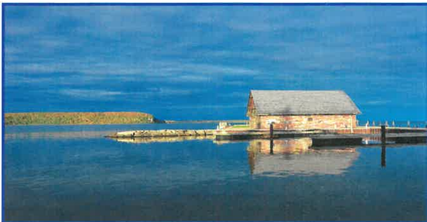
Anderson Marina Fall 2016